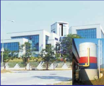
TNB Office Building, Bangi Capacity: 1,000RTh, Size: 12' Dia x 20' H