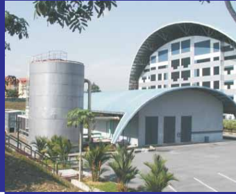
TNB R&D Centre, Bangi Capacity: 3,300RTh, Size: 20' Dia x 30' H