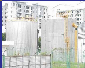
Multimedia University, Cyberjaya Phase 2 Capacity: 11,000RTh, Size: 29' Dia x 41' H