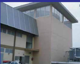
Nusajaya DCS, Johor Capacity: 35,000RTh, Size: 44.5' Dia x 57' H