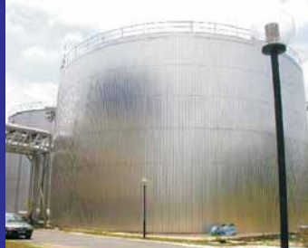
District Cooling Plant 2, Cyberjaya Phase 2 Capacity: 100,000RTh, Size: 87' Dia x 49' H (Ice tank only initial as Chilled Water Storage)