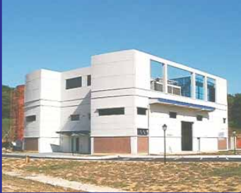
District Cooling Plant 2, Cyberjaya Phase 1 Capacity: 7,500RTh, Size: 22' Dia x 49' H