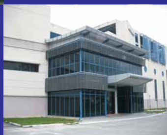
District Cooling Plant 2, Cyberjaya Phase 2 Capacity: 31,200RTh, Size: 87' Dia x 49' H (Ice System Conversion)