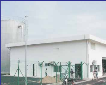
AIMST University, Sungai Petani Capacity: 9,300RTh, Size: 26' Dia x 43' H